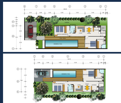
TYPICAL POOL VILLA PLAN